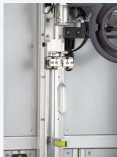
Product Guidance Balloon