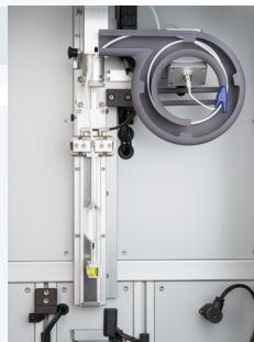
Product Guidance Catheter

Inflation and deflation measurement: cycle measurement filling and emptying of the product